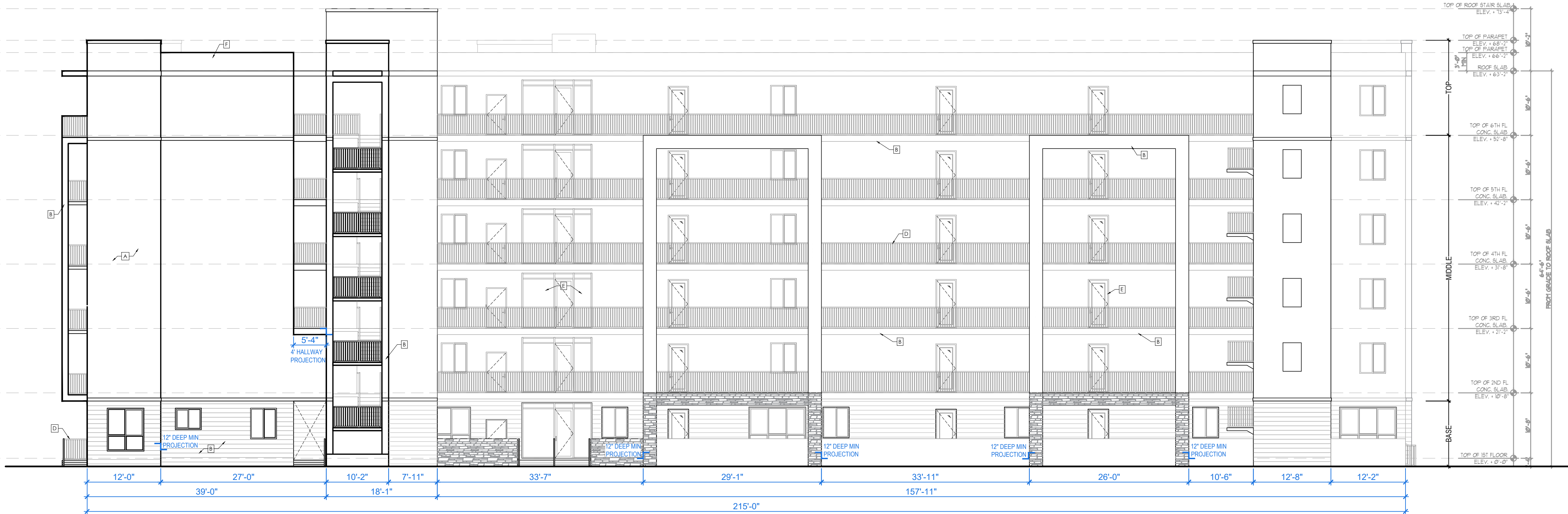
TYPE 52 UNIT BUILDING - REAR ELEVATION